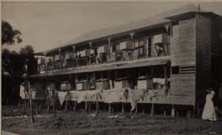
"Nuevo Kingston," a Negro tenement of Empire. Each sheet-iron cooking-place on the veranda rail represents a family